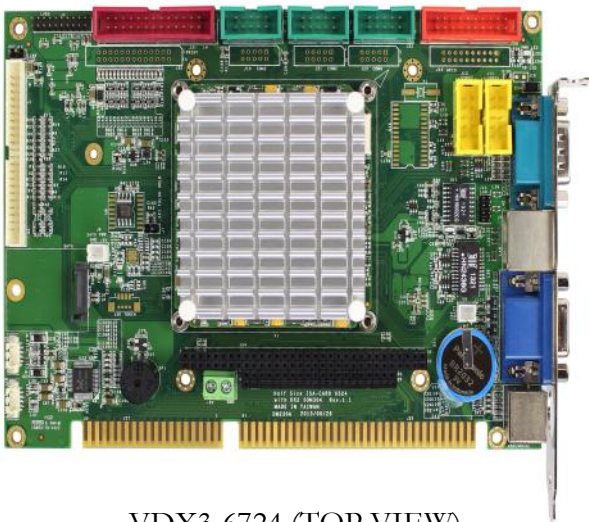
VDX3-6724 (TOP VIEW)