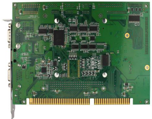
VDX3-6724 (BOTTOM VIEW)