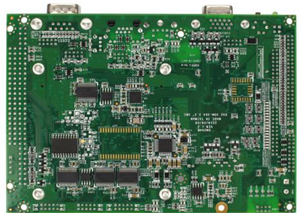
VDX3-6726 (BOTTOM VIEW)