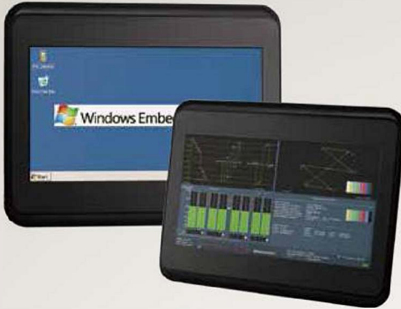
▲ HMI-043T BOX SERIES