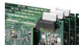
SSI bus cable for multiple cards synchronization